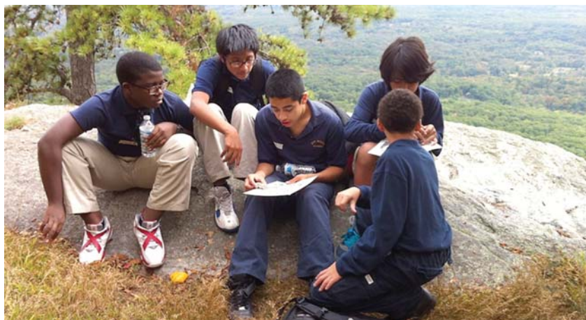
High upon "the ridge" our boys do some of their best learning!

One of our most enduring and productive educational partnerships is with Mohonk Preserve located on the ridge of the Shawangunk Mountains near New Paltz, New York. For almost 8 years SMAN and the preserve have partnered for the benefit of our students. Minority males are the most unrepresented demographic in ecological studies and in the