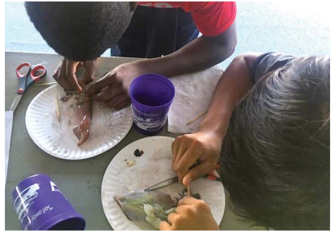
8th graders carefully dissect squid during their week long immersion in marine biology on Block Island.