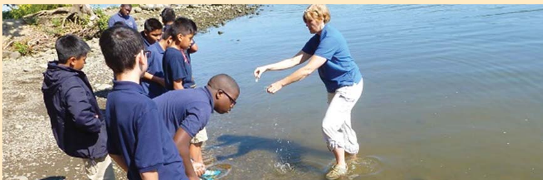
Exploring the ecosystem of the Hudson River is among the favorite activities enjoyed by SMAN students at Constitution Marsh Audubon Sanctuary.