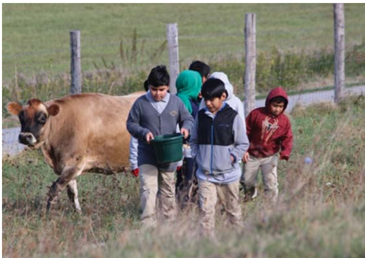
Fifth grade boys carry out their chores upon arrival to Stony Kill Farm every Tuesday morning.