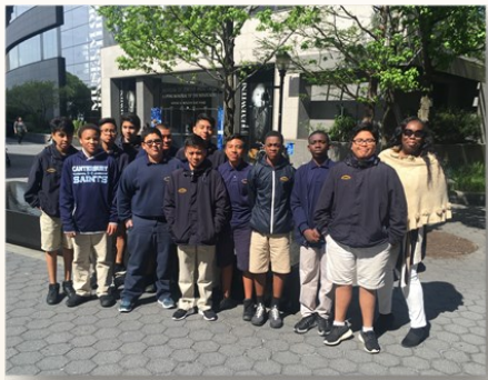
Class of 2017 during a recent trip to the Museum of Jewish Heritage in NYC

At San Miguel, Erick participated in the following clubs: Grade 6: Lego and Rowing Clubs Grade 7: Fitness and Rowing Clubs, Soccer Team and Saturday Film, Food, and Cooking Clubs — Grade 8: Soccer and Rowing Teams