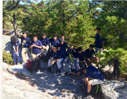
Class of 2017 at Mohonk Preserve where they are training to become Junior Rangers