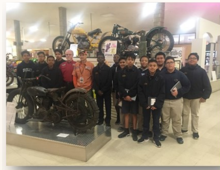
Class of 2017 at Motorcyclepedia Museum in Newburgh where they learned about vintage motorcycles used in WWI and WWII